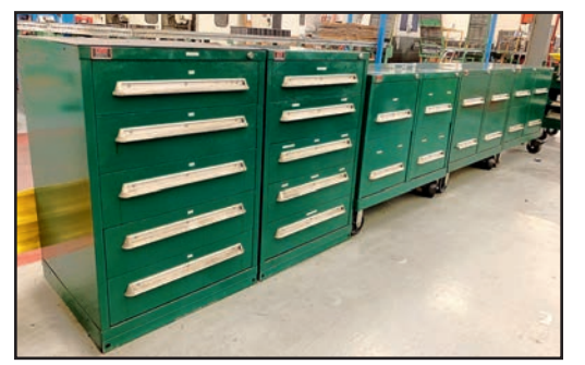
VIEW OF TOOL CABINETS