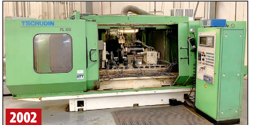
SCUHDIN PL155 UNIVERSAL GRINDER