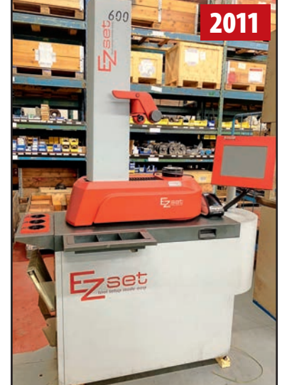
EZ SET 600 TOOL PRESETTER TOOL PRESETTERS 2011 EZ SET 600 TOOL PRESETTER SPERONI KPT TOOL PRESETTER, s/n 179717, 2-Axis DRO

HOLROYD BALANCER, Approx. 7' Between Centers