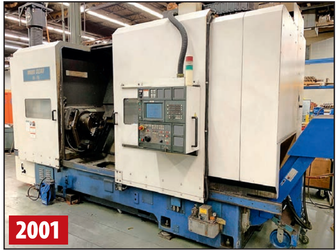
MORI SEIKI SL-75B CNC TURNING CENTER

BALANCERS, PRESETTERS, CAT 50 TOOLING & MORE