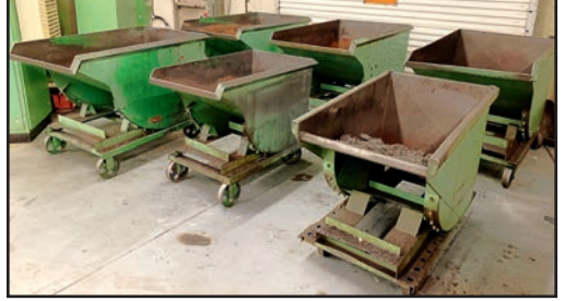
VIEW OF SELF-DUMPING HOPPERS

View our current auction schedule at www.perfectionindustrial.com