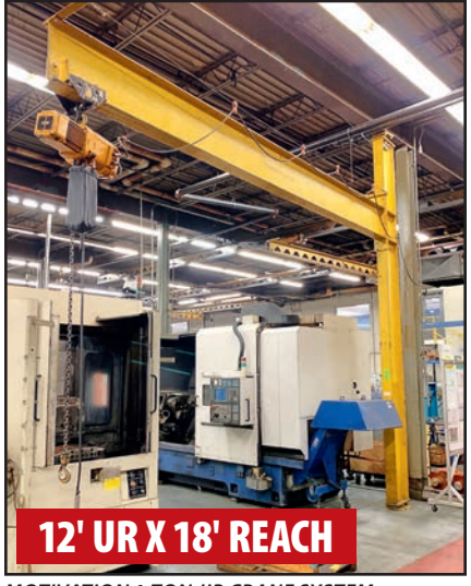
MOTIVATION 1-TON JIB CRANE SYSTEM

INCLUDING: CRANES, SELF-DUMPING HOPPERS, STEEL ROLLING CARTS, ROLLING TOOL CABINETS, ROLLING SHOP WORK BENCHES, TOOLING CADDY CARTS, FLAMMABLE LIQUIDS CABINET, BENCH CENTERS