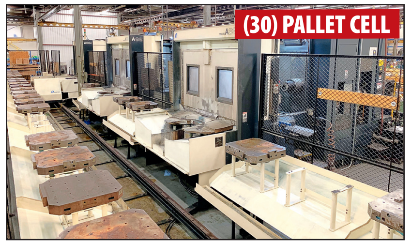
COMPLETE MAKINO A88 MACHINING CELL/PALLET POOL

2006 MAKINO A88E CNC HORIZONTAL MACHINING CENTER