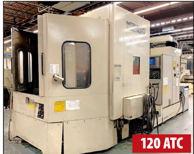
MITSUI SEIKI HU63A CNC HORIZONTAL MACHINING CENTER