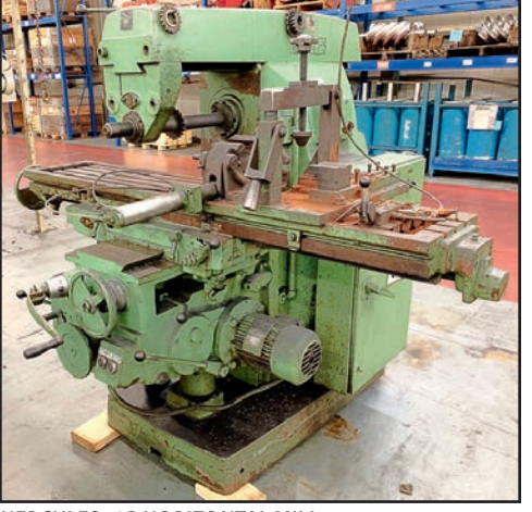
HERCULES #3P HORIZONTAL MILL