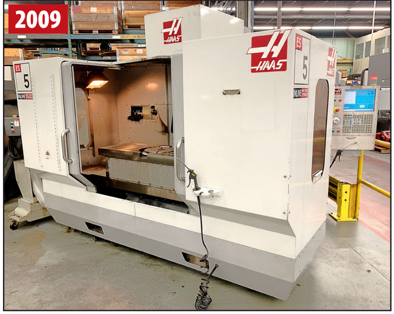
HAAS ES-54AX CNC HORIZONTAL MACHINING CENTER

BALANCERS, PRESETTERS, CAT 50 TOOLING & MORE